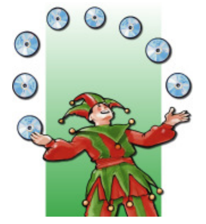
Available as CD-ROM or Network version for your Intranet (Internet Server) or LMS.

Business Territory 2 takes you on a guided tour behind the scenes at the University Arms - a four star hotel in Cambridge (UK). Students have access to short video interviews with real members of staff, not actors - all the interviews are entirely authentic and unscripted. For anyone learning about, or working in, the Hotel and Catering business, this is a new and ideal way to improve your English.