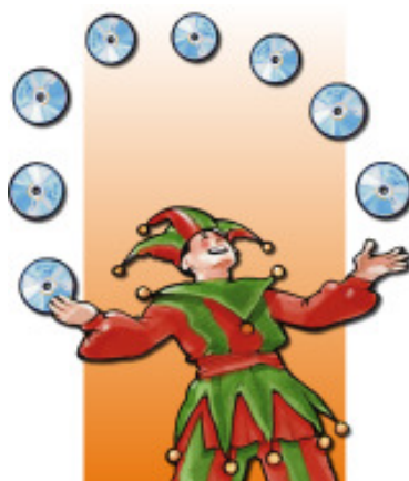
Available as CD-ROM or Network version for your Intranet (Internet Server) or LMS.

Business Territory 1 offers students the chance to visit a real British company without leaving the classroom. The program is based on a series of authentic video interviews recorded at a Cambridge electronics company and includes a wealth of built-in language support in the form of transcripts, paraphrases, a glossary, and audio comments giving both linguistic and business information. There are comprehension and auditing tasks to be completed on-screen but also many attractive