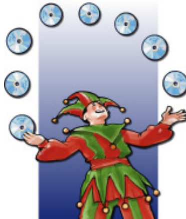
Available as CD-ROM or Network version for your Intranet (Internet Server) or LMS.

It is not easy to say what you think. Expressing opinions is not just a question of having something to say; it requires the ability to communicate effectively. We need to know when it is appropriate to be blunt and when it would be better to take an indirect approach. Vox Pop multimedia program is aimed at students of English who need to improve their skills in expressing both oral and written opinions. The program is based on forty-eight authentic video interviews recorded on the streets of Cambridge in England. The people who feature in this program are all ordinary people who were stopped