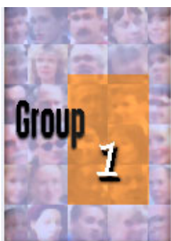
Group icon on the first page

Each interview is examined in five parts. These parts are accessed from the group screen. In each group screen, there is a menu with six people and, in conjunction with each person, five exercises.